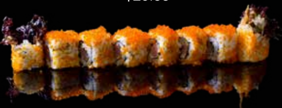
SH40 Fresh Uni Hokkaido Maki $65.00