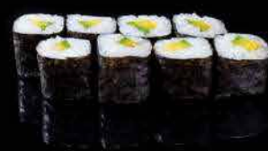
SH 47 Avocado Maki 鳄梨Maki $8.00