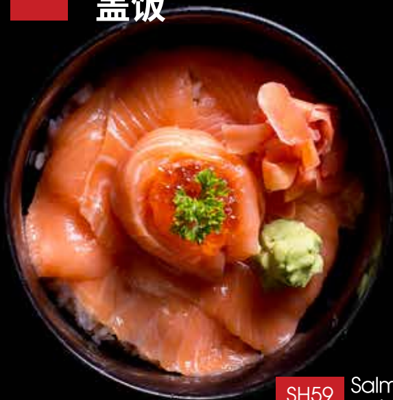
SH59 Salmon Ikura Don 三文鱼子在饭碗上 $42.00 Sushi rice, Salmon, Ikura, ginger pickle and washabi