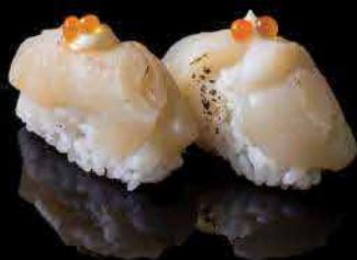
SH20 Hotate Aburi Nigiri Hotate Aburi寿司 $12.00