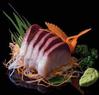
SH14 Hamachi Sashimi 新鲜的小鰺金枪鱼生鱼片 $15.00