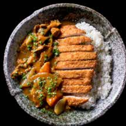
SH63 Katsu Curry Rice 鸡咖喱饭 $28.00 Steamed rice, curry (beef slice, onion), Katsu(fried chicken)