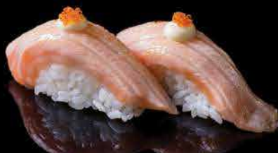
SH25 Aburi Salmon Nigiri Aburi三文鱼寿司 $11.00