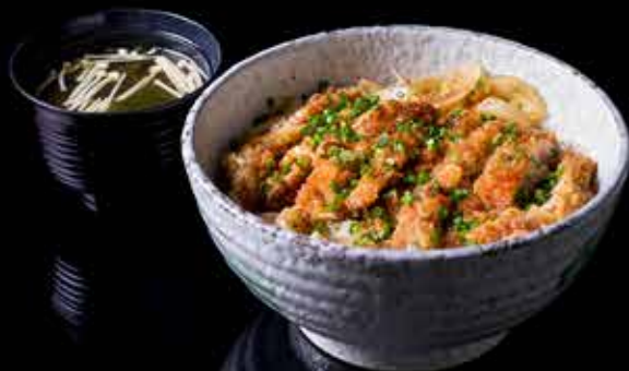
SH65 Katsudon with Miso Soup 日式鸡肉排丼 $28.00 Steamed rice, Katsu (fried chicken), onion, spring onion and sesame seed topping, served with Miso soup