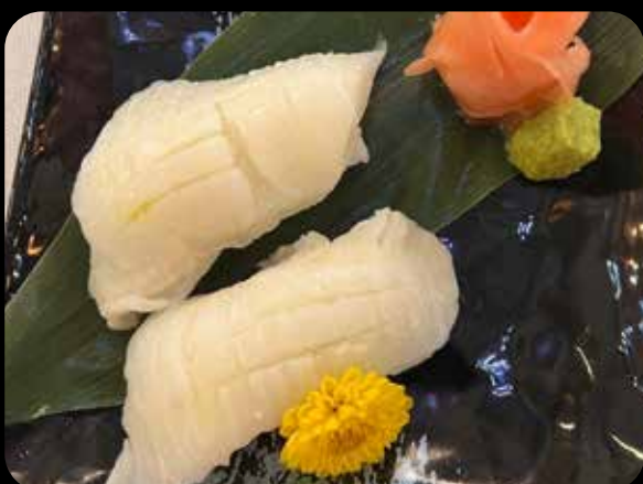
SH147 Halibut / 가자미 Engawa Nigiri 大比目鱼 $24.00