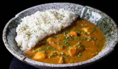
SH62 Curry Rice with Black Angus 咖喱饭 $34.00 Steamed rice with curry (beef slice, onion)