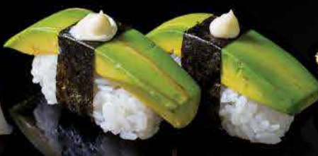
SH30 Avocado Nigiri 鳄梨寿司 $4.50