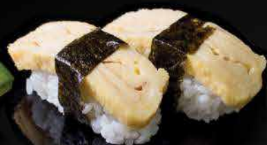
SH31 Tamago Nigiri Tamago寿司 $4.50