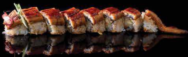
SH39 Dragon Maki Eel 龍Maki鰻魚 $25.00