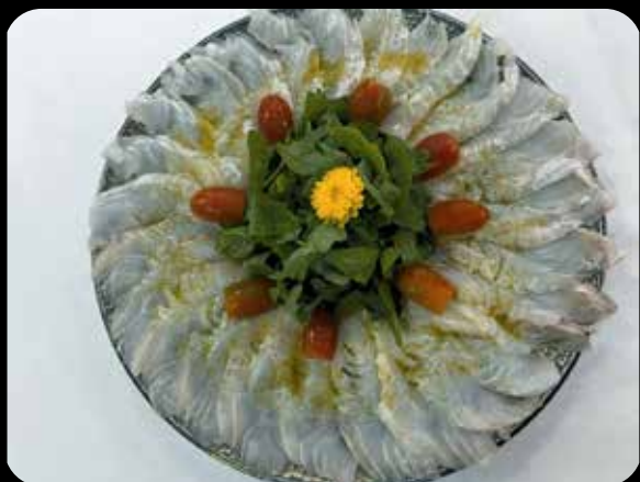
SH149 Carpaccio Halibut / 가자미 Fresh Ocean 大比目鱼 160$