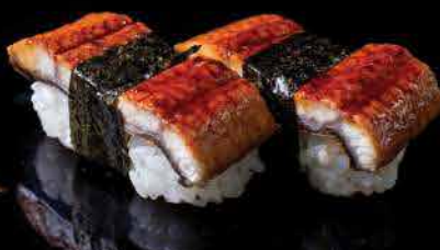
SH22 Unagi Nigiri 鳗鱼寿司 $13.00