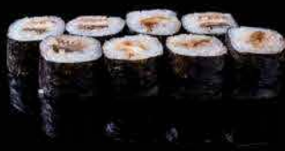
SH 45 Unagi Maki 鳗鱼真希 $9.00