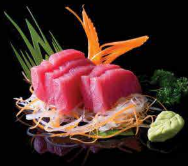
SH10 Tuna Sashimi 新鲜的金枪鱼生鱼片 $13.00