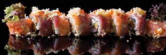
SH38 Double Salmon Maki 双鲑鱼Maki $28.00