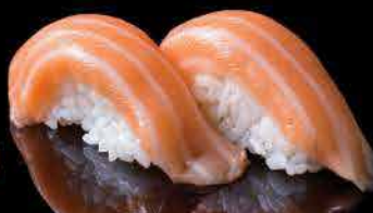
SH26 Salmon Nigiri 新鲜的三文鱼寿司 $11.00