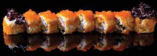
SH36 Softshell Crab Maki 软壳蟹Maki $26.00