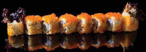
SH35 Spicy Tuna Maki 金枪鱼卷 $24.00