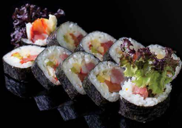
SH41 KYOTO MAKI Kyoto 卷 $24.00