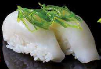
SH29 Ika Nigiri 鱿鱼寿司 $9.00