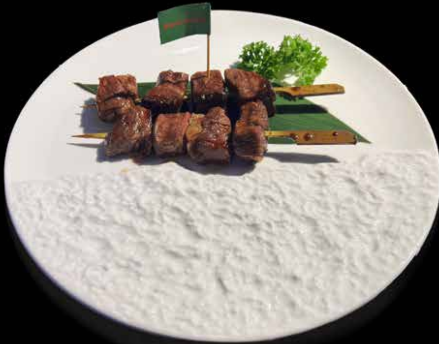
SH74 Beef Black Angus 烤黑安格斯牛肉 $70.00