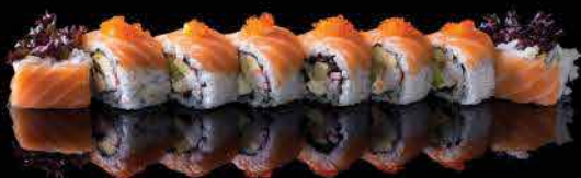
SH37 Norwegian Salmon Maki 挪威三文鱼Maki $26.00