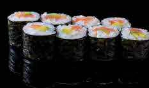
SH 51 Salmon Avocado Maki 三文鱼鳄梨Maki $9.75