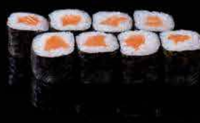
SH 50 Salmon Maki 三文鱼Maki $9.00