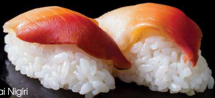
SH19 Hokkigai Nigiri 曲棍球贝类寿司 $9.75