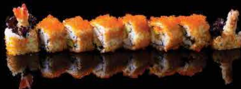
SH34 Crunch Maki Crunch Maki卷 $22.00