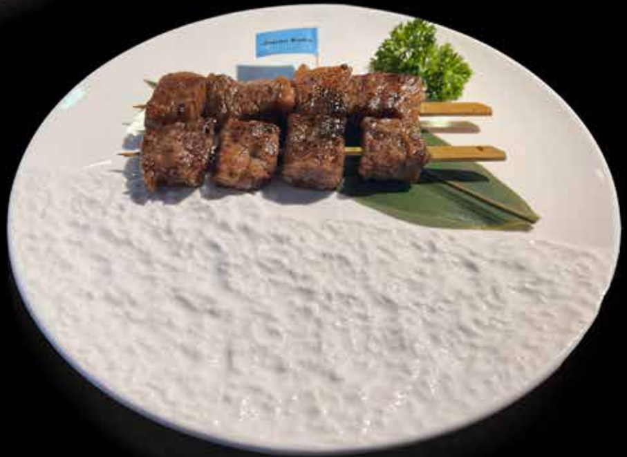
SH81 Wagyu Kobe A5 和牛神户A级 $118.00