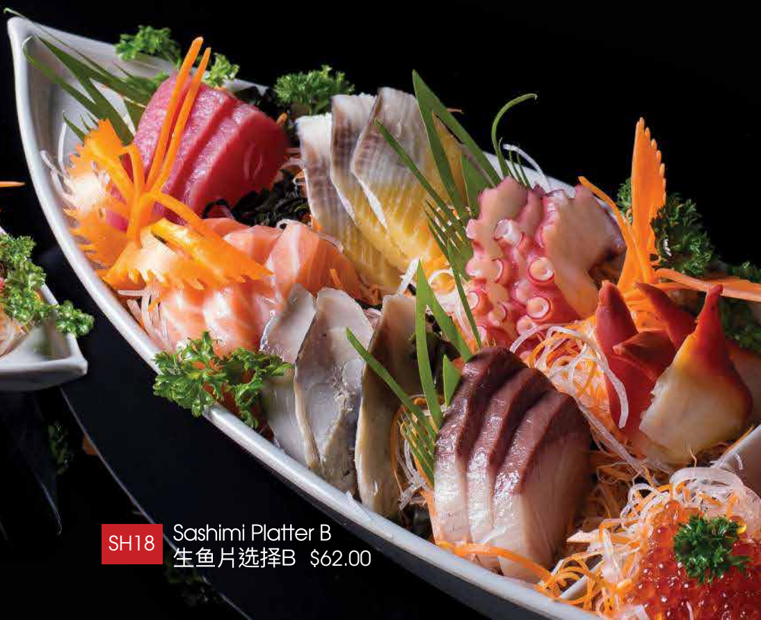
SH18 Sashimi Platter B 生鱼片选择B $62.00