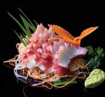
SH16 Tako Sashimi 新鲜的章鱼生鱼片 $14.50