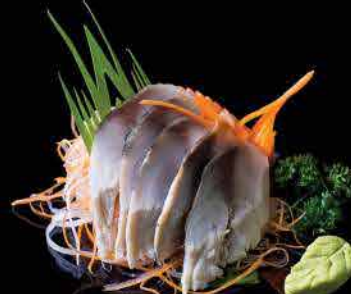
SH15 Shime Saba Sashimi 新鲜的鲭鱼生鱼片 $11.00