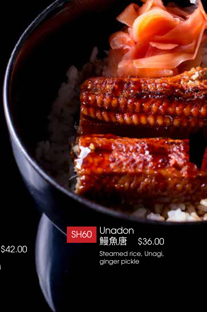
SH60 Unadon 鰻魚唐 $36.00 Steamed rice, Unagi, ginger pickle