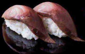
SH21 Hamachi Nigiri Hamachi寿司 $11.00