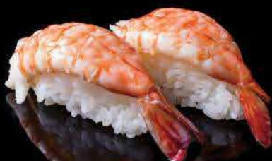
SH28 Ebi Nigiri 江戸寿司 $12.00