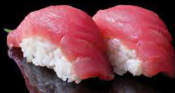
SH27 Tuna Nigiri 新鲜的金枪鱼寿司 $11.00