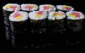
SH 49 Tuna Avocado Maki 金枪鱼鳄梨Maki $12.00