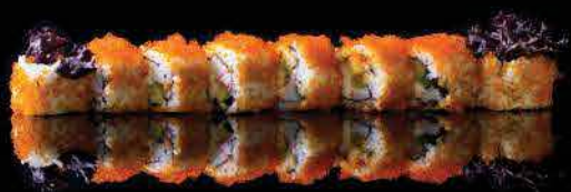
SH33 California Maki 加利福尼亚Maki $22.00