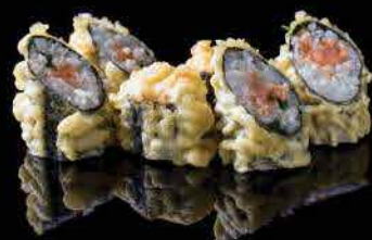
SH 44 Salmon Tempura Maki 天妇罗三文鱼Maki $28.00