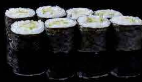
SH 46 Cucumber Maki 黄瓜希里 $7.00