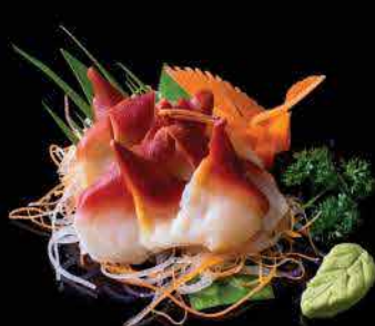
SH13 Hokkigai Sashimi 新鲜的曲棍球贝类生鱼片 $14.50