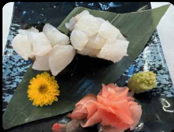
SH146 Halibut / 가자미 Gunkan 大比目鱼 $38.00