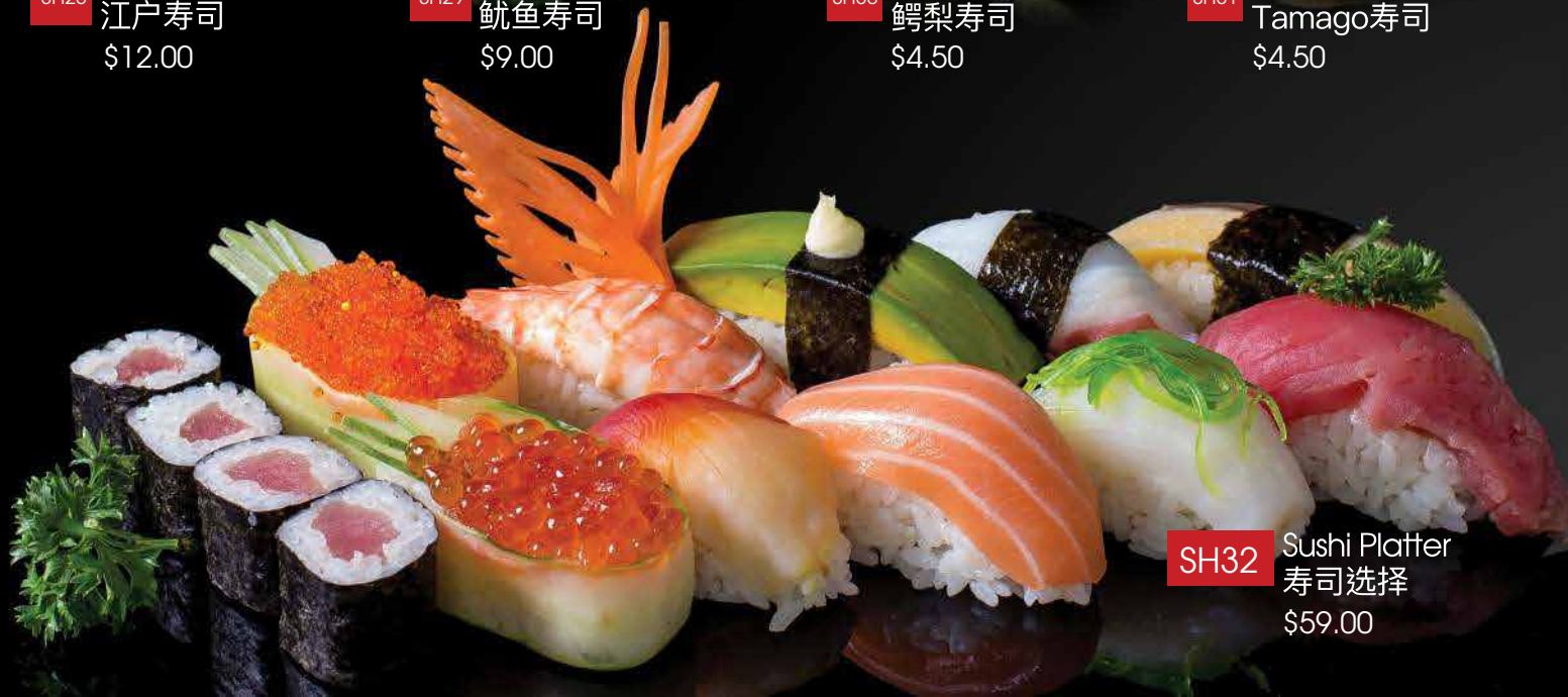
SH32 Sushi Platter 寿司选择 $59.00