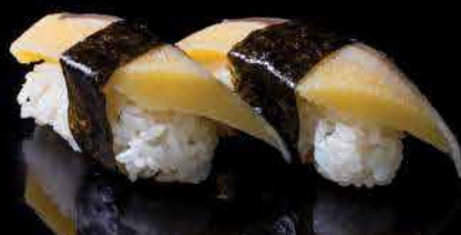
SH23 Nishin Nigiri 欣欣鲑鱼寿司 $9.00