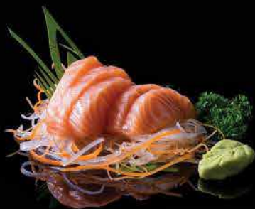
SH11 Salmon Sashimi 新鲜的三文鱼生鱼片 $11.00