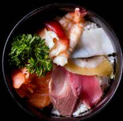
SH61 Chirashi Don 唐传单 $28.00 Sushi rice, Salmon, Red Tuna, Prawn, Ika, Hamachi, Ginger pickle and Washabi