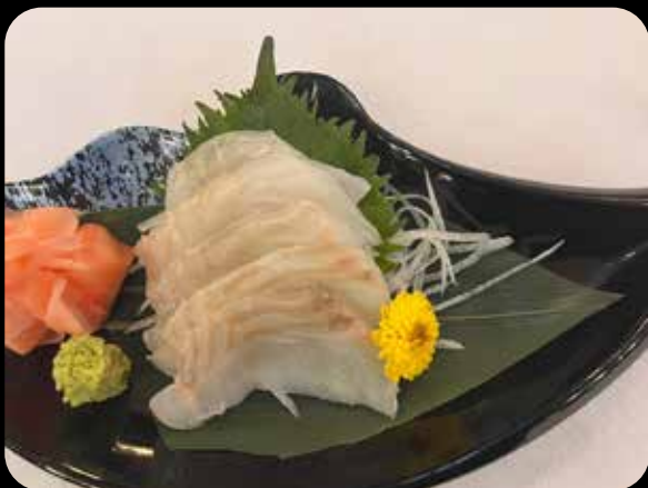
SH145 Halibut / 가자미 Sashimi 大比目鱼生鱼片 $30.00