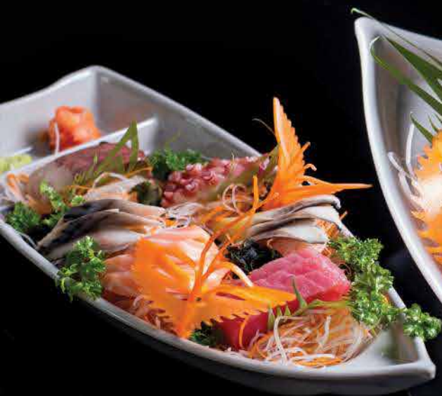
SH17 Sashimi Platter A 生鱼片选择A $42.00