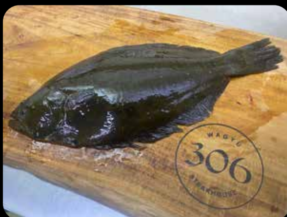
SH148 Halibut / 가자미 Fresh Wild 大比目鱼 1 fish / 190$