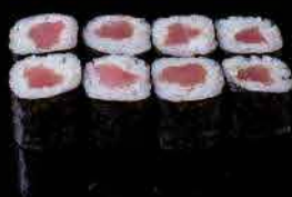
SH 48 Tuna Maki 金枪鱼希 $11.00