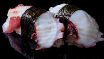
SH24 Tako Nigiri 章鱼寿司 $9.00