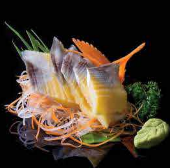
SH12 Nishin Sashimi 新鲜的西生生鱼片 $11.00